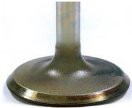
Intake valve after service